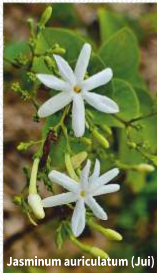
Jasminum auriculatum (Jui)